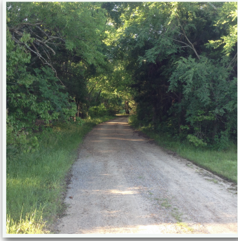
Entry to the Retreat Center