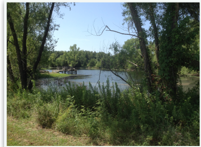
Lands and Lake

Established three decades ago as a Retreat Center, it has been a place of reprieve for many individuals and groups who have used it for quiet rest and reflection. It continues this ecumenical ministry which is open for wisdom seekers and contemplatives from many different religious traditions. Now owned by the Oriental Orthodox Order of the West, and a part of a larger Contemplative Wisdom community, the center welcomes folk seeking its quietude in many ways.