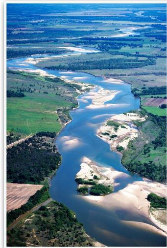
The Red River

These are restful and pastoral acres nestled in a wooded countryside among working farms and ranches off a gravel road. Shaded woods, open meadows and native prairie lands, a small lake, and a creek grace the lands. In addition, nature trails run throughout the property leading to quiet, wooded spaces, camp sites, grassy open meadows, old orchards and a pioneer gravesite more than a century old.